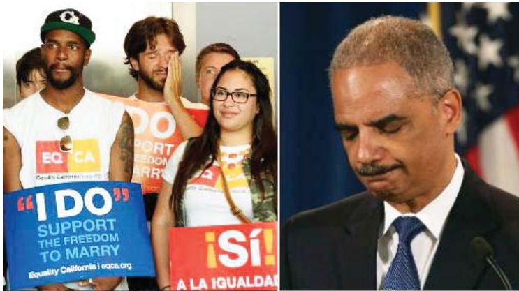
Gay-rights activists ; Eric Holder after the SCOTUS Voting Rights Act decision