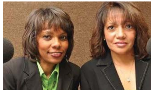
Hosts of the Small Business Exchange (SBE) Talk Radio